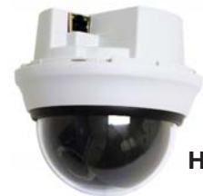
HD3HDIHX shown with mounting ring for surface mount